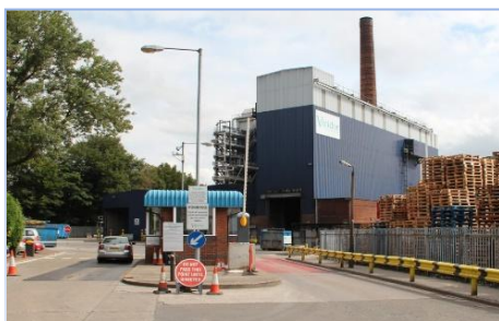
Entrance to the ERF Bolton Plant

Bolton ERF is located in Greater Manchester in North West England, and the plant is under contract between Greater Manchester Waste Disposal Authority and Viridor (Greater Manchester). The plant management was unhappy with the waste treatment capacity, and Dublix Engineering was brought in to evaluate the possibilities of using high-level control for improving the overall combustion efficiency.